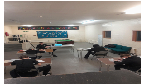
Some of our pupils taking part in the theory and planning phase of the programme