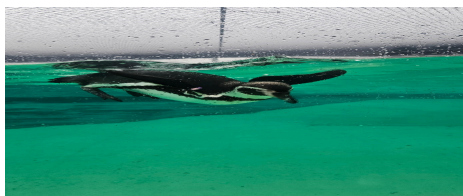
Pingu the Penguin preening, paddling and playing