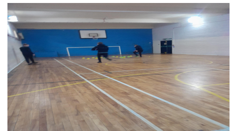
Practising their physical skills