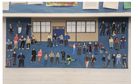
A lovely piece of art representing staff and pupils - a wonderful collaborative effort