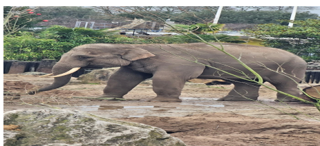
Nelly the elephant on parade

Just a few of the images taken on the day: