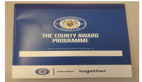
Official logo on the programme

A huge thank you to Stockport County Football Club for their continued support, commitment, and belief in empowering young people, teaching them that football is not just a great sport - it can inspire positively, strengthen communities, and create lasting opportunities for growth.