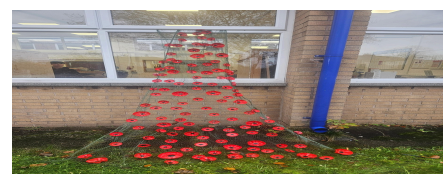
The lovely poppy waterfall display

The display was hanging from the front of the vale site for Remembrance Day. It looked beautiful and we thank everyone involved in its creation.