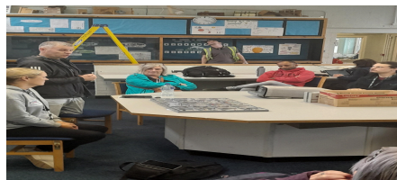
Staff being updated on the current state of drug and alcohol misuse

As usual, contact information for MOSAIC can be found at the end of this newsletter.