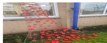
The display from a slightly different angle